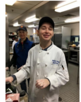
CSAC supports people in finding meaningful employment.